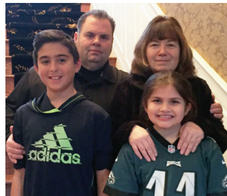
The Semerjian Family

"I've always realized that, as it relates to private schools, while the tuition may seem like it's a